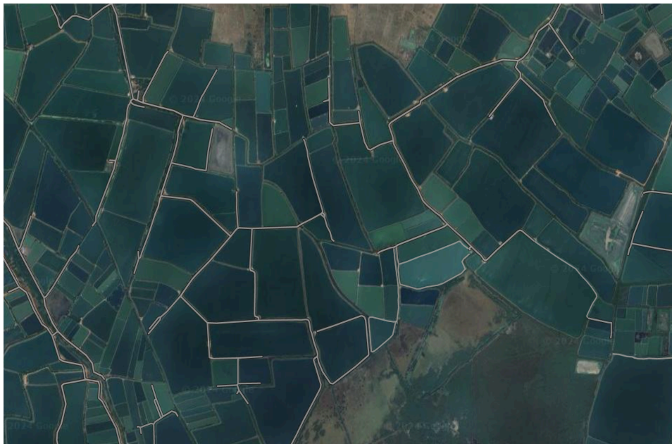
Figure 1. Satellite image showing a patchwork of fish farms in the Eluru region of Andhra Pradesh, India.

The ARA focuses its support on farmers of Indian major carps (IMC) in two districts—Eluru and Nellore—in Andhra Pradesh. IMCs are farmed in earthen ponds, ranging in size from 1 acre to over 100 acres, with the average size of ARA-member farms being 12.4 acres. The depth of the ponds is typically 1.5 to 2 meters. Ponds are typically found close to each other—often side-by-side, separated by earthen banks (Figure 1). It is water bodies like this for which FWI is striving to develop capabilities for satellite-based remote sensing to detect water quality.